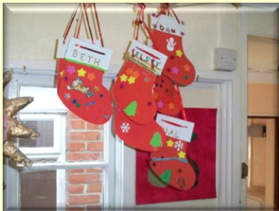
Children with Learning Difficulties